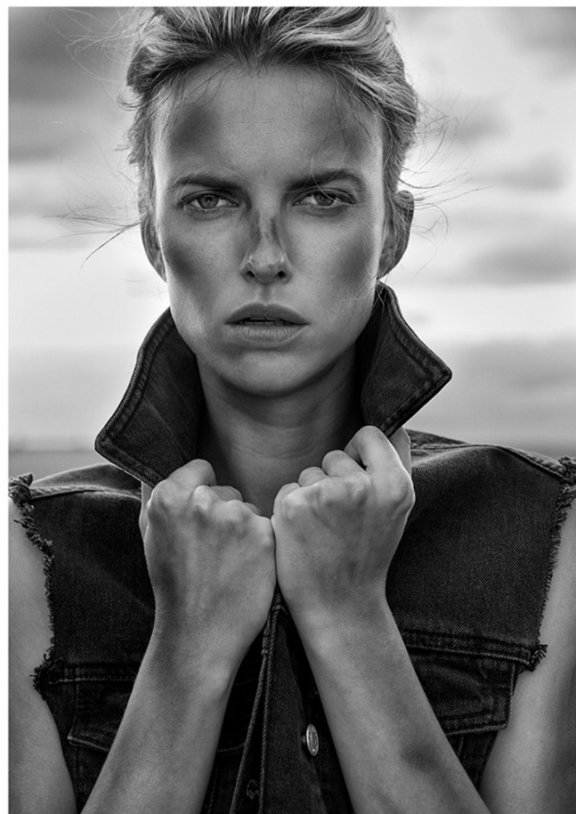
opening page, suit Zara , t-shirt H&M , brogues Dune , opposite page, coat Country Road , trousers H&M , this page, denim wasitcoat Topshop